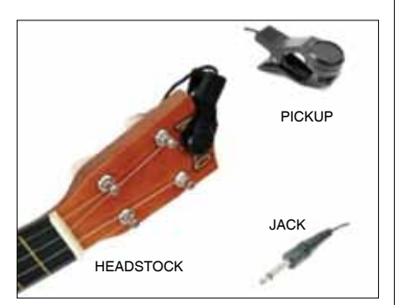
Fig. 1: A typical example of mounting the guitar pickup

Fere is the circuit of a guitar preamplifier that would accept any standard guitar